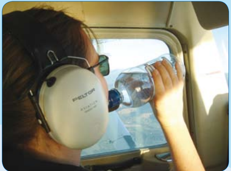
It is very important to carry sufficient rehydration fluid in the cockpit and to drink regularly.

It can be difficult to carry water in aircraft with limited storage space. It may be possible to stow a water bladder with a straw, so that water can be consumed during flight. A water bladder commonly used by endurance athletes, obtainable from a sport shop may be suitable. Otherwise, carry a couple of bottles that allow you to monitor the amount of fluid you drink. Alternatively, consider planning your flight to incorporate stops where you can consume some fluid.