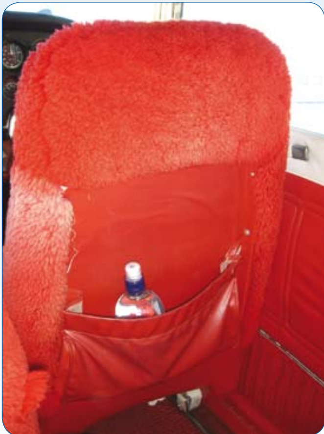
Ensure your water bottles are safely stowed so they don't fall onto the cockpit floor and possibly interfere with the rudder pedals.

Remember, the amount of water you need to drink will depend on work level, temperature, and individual physiology.