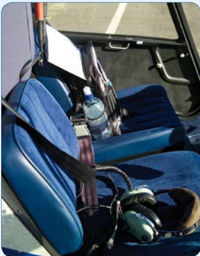
In some types of aircraft with limited storage space it may be difficult to stow water. It may be possible to use your flight bag.