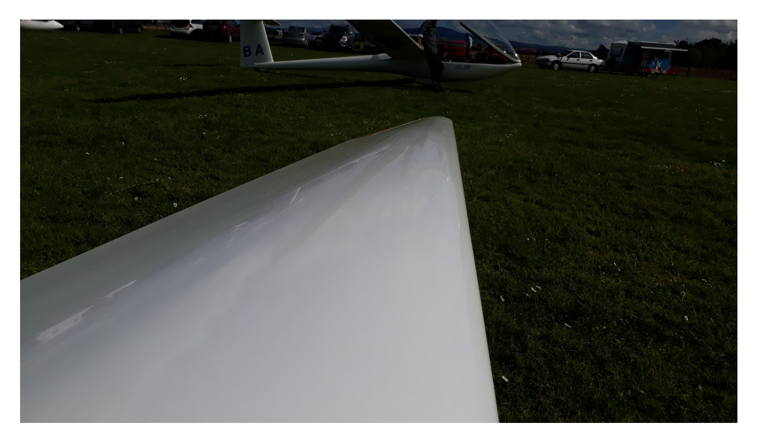
NI's shiny new wings