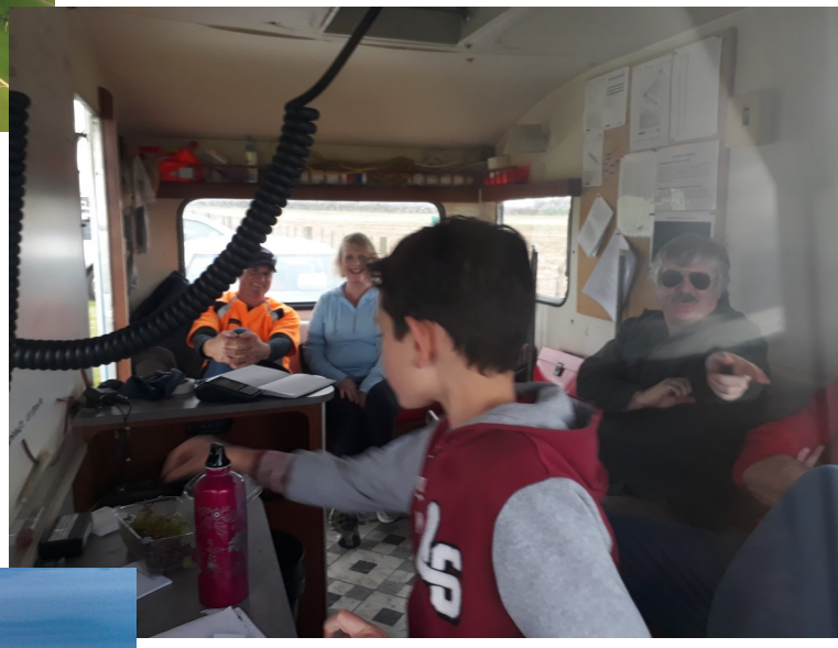
The caravan team with our newest duty pilot