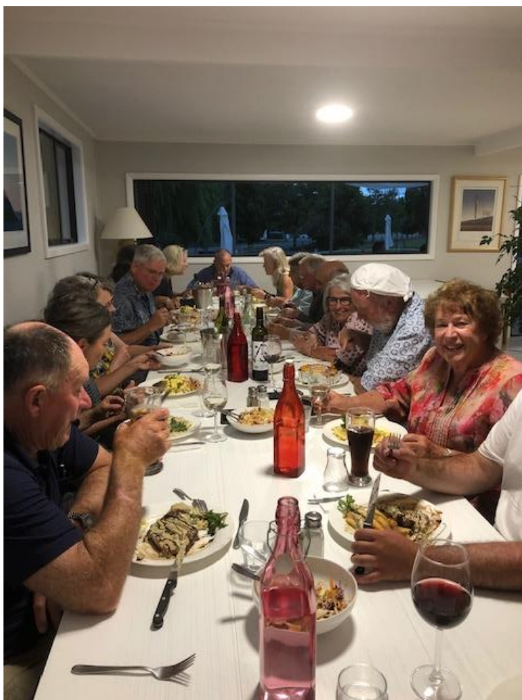
OGC Members enjoying dinner at The Pink Cafe