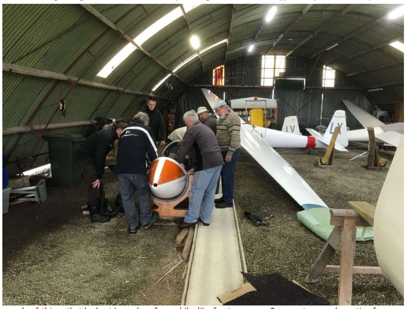
couple of things that had not been done for a while, like for two years. Compass turns and practice force

So he had to go and get her himself. Saturday morning was nice and the opportunity was taken to practice a