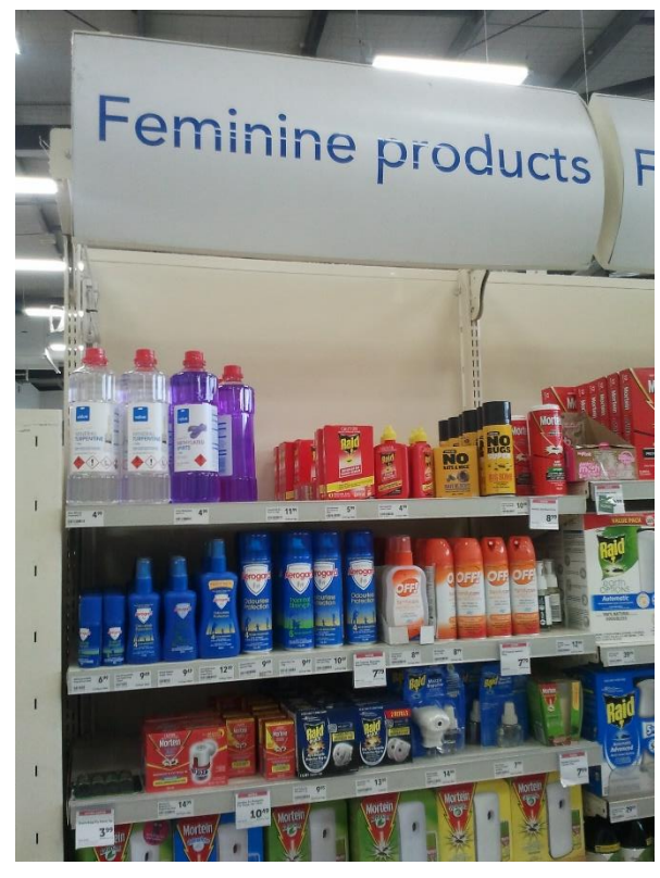
Only in Matamata New World!