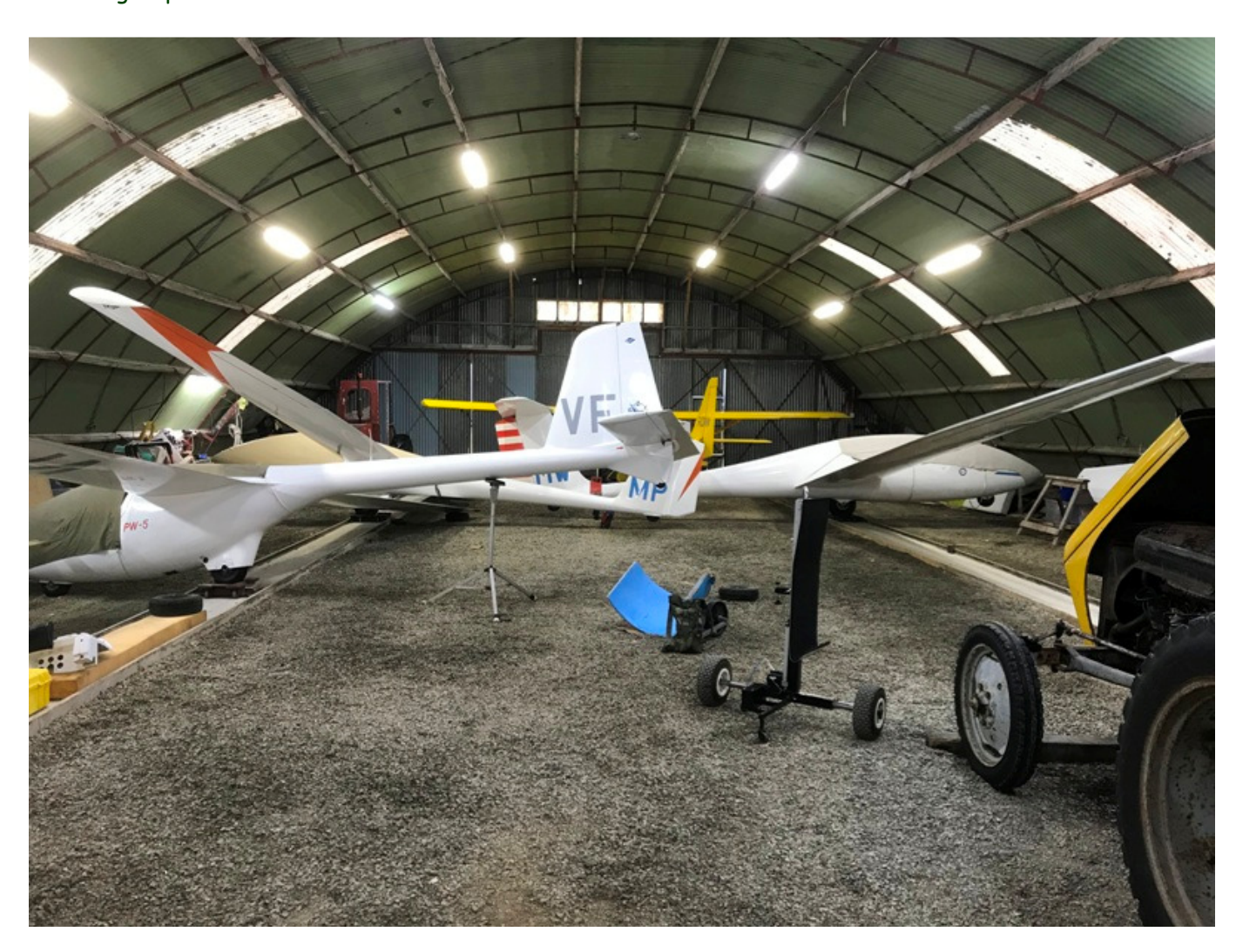
With no further arrivals, or calls from keen pilots, we eventually decided to close up and go home. The sun was still shining, between occasional showers, although the westerly was quite stiff. Sadly it was another day without any flying.

where a group from ATC were hard at work.