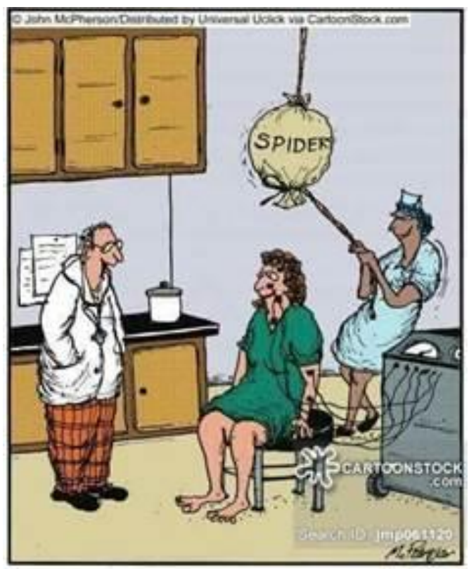
"That's right! No huffing and puffing for 30 minutes on a treadmill. We've developed a new stress test that is faster and more accurate."