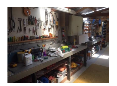
PLEASE - Put the bloody things away after you've used them!