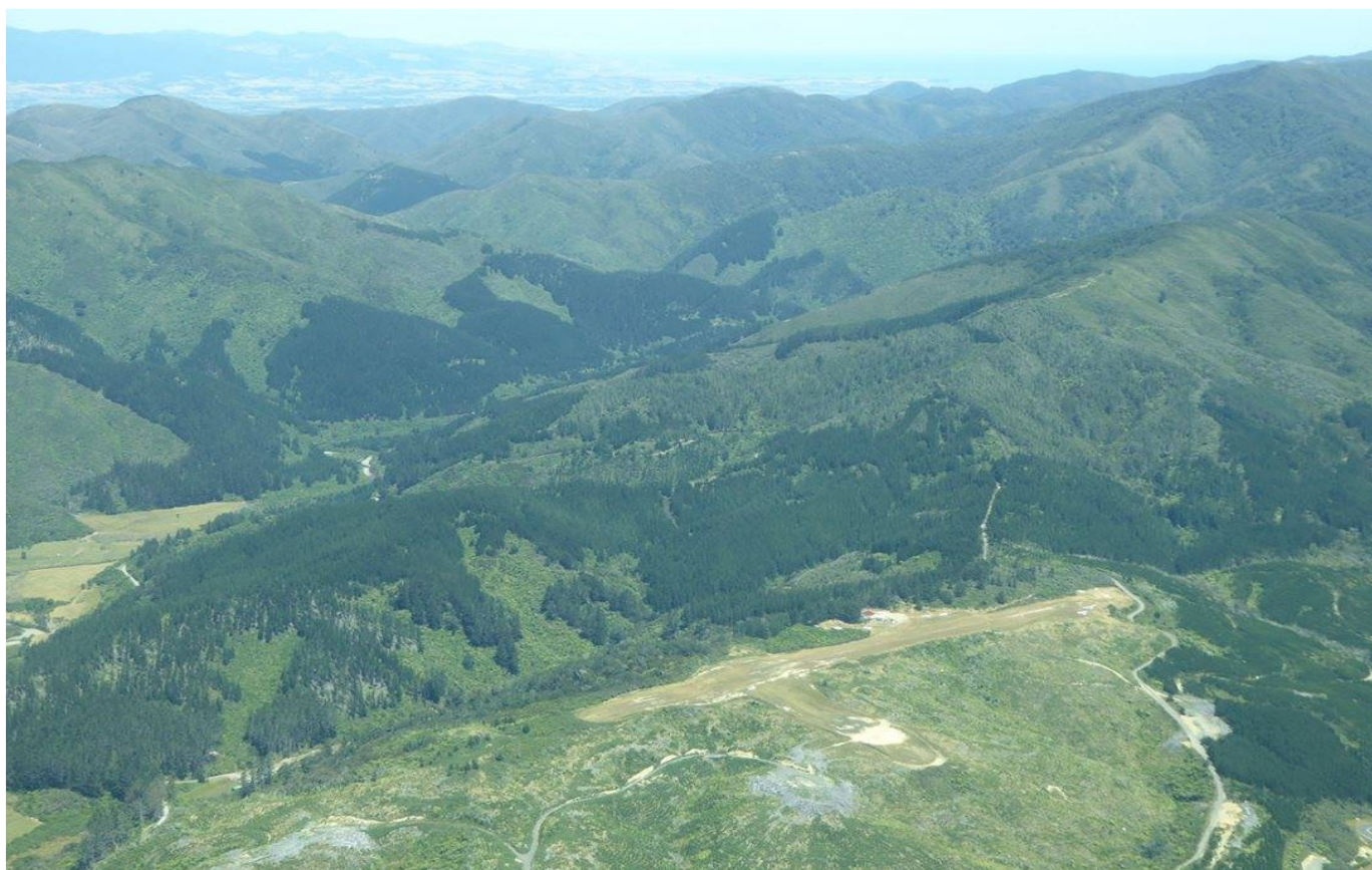
airfield and Mt Kakariki and May morn to the north of the field.