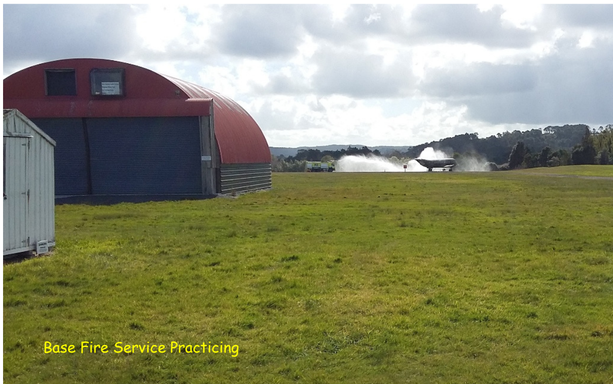
Base Fire Service Practicing