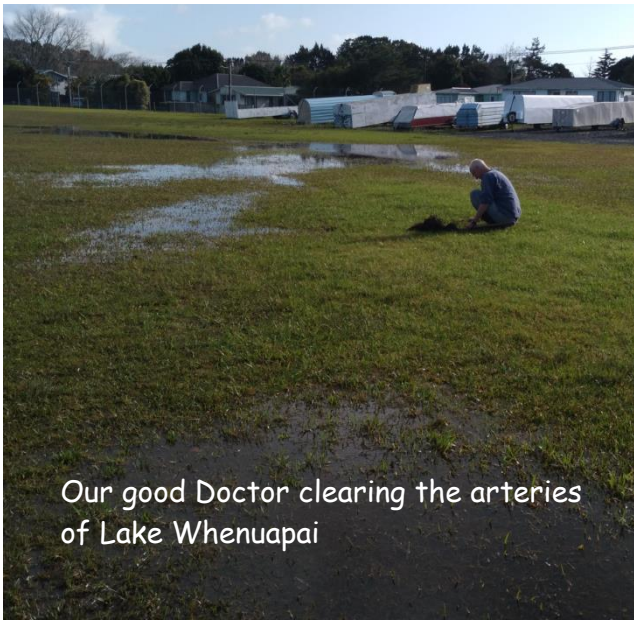
Our good Doctor clearing the arteries of Lake Whenuapai