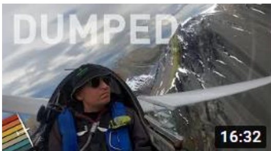
The biggest wave dumping I've ever had: caught on video! - YouTube