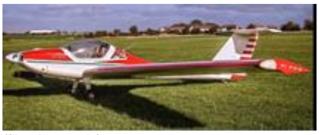
(file photo only)

Drury hangar space wanted . Contact Peter Himmel on 0210768805 or himlp@xtra.co.nz