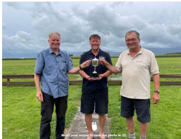
More your mouse to view the photo in 3D