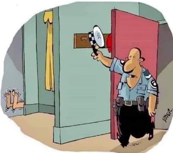
"I'm home...What a terrible day...I took your ladyshaver to work instead of my taser!"