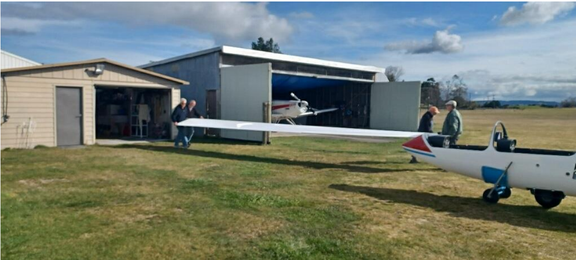
Members' assembling GME after annual inspection and polishing