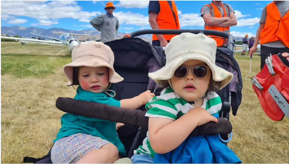
The Oakley girls watch their grandfather flying in Open Class.