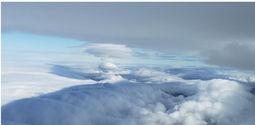
Looking up the Two Thumbs

Easterly conditions have made flying quite different in Omarama this summer. 09 has been the dominant take off and landing direction. The normal strong westerlies have been almost nonexistent! The south and east facing ridges have been working. To the west we have experienced great cloud bases and reliable thermals with outrageous convergence on the West Coast. The flats of the Mackenzie Basin have been often working reliably. There has even been Easterly wave setting up! Kelvyn took these pictures flying in easterly waves a week before Christmas.