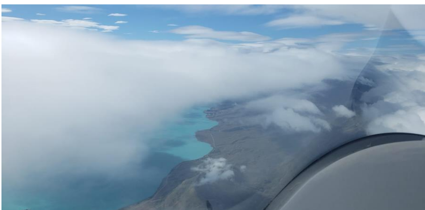
Easterly wave over the Hunter Hills

For the last two weeks there has been so much good flying around Omarama. Perfect flying conditions for the NZ Gliding Nationals competitors, visiting pilots holidaying in Omarama, student pilots and Youth Glide.