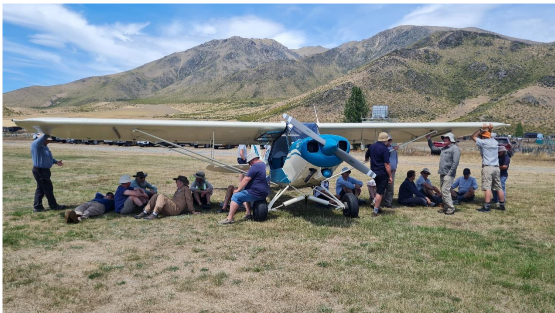
Gavins cub makes a perfect sun umbrella while we wait for the thermals to kick off.

Below are a few of my favorite pictures: