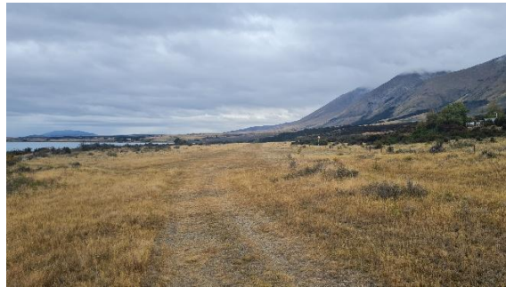
Ohau Lodge looking south