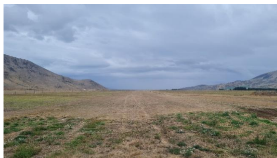
Clearburn looking South