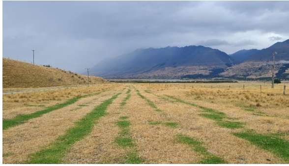
Maitland looking north.

I took photos of the landout strips as we delivered gifts. They all looked great to land on!