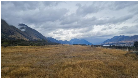
Ohau Lodge strip looking north