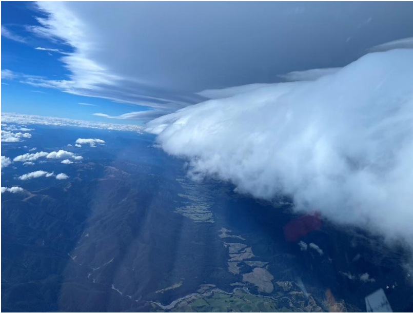
Flying in wave on the lea side of the Ruahines