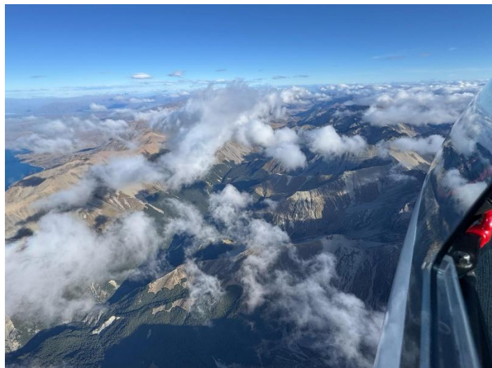
Chris Streat took this picture in wave over the Dingle in the club Discus 2b ZS on 27 th April