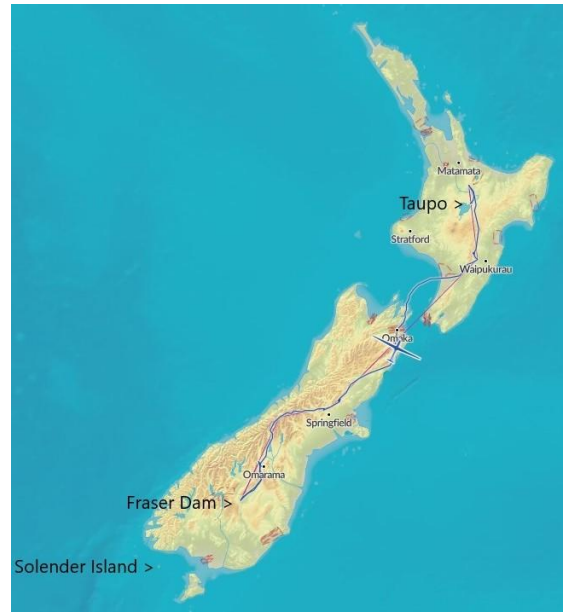
1200kms and Solander Island