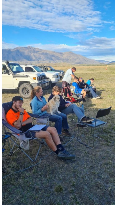
It's always fun relaxing beside the launch point caravan.