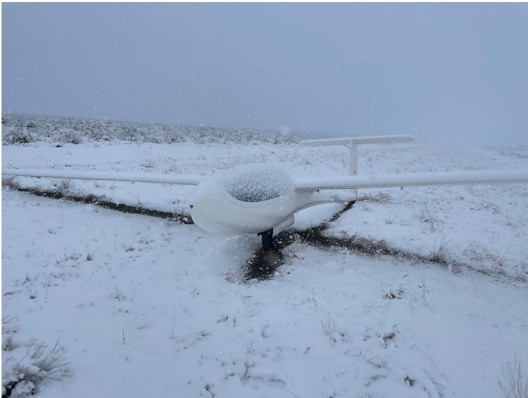
Ice age gliding ~ Justins Antares 18m on the Upper Hawkduns strip the next morning!