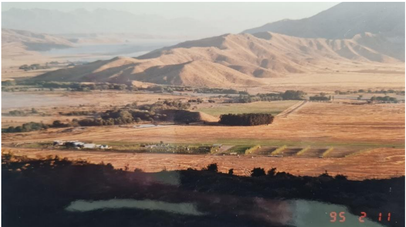
Craig showed me a photo of Omarama Airfield in 1995

“A new vision for Omarama can only be achieved if we take the will of the membership with us.”