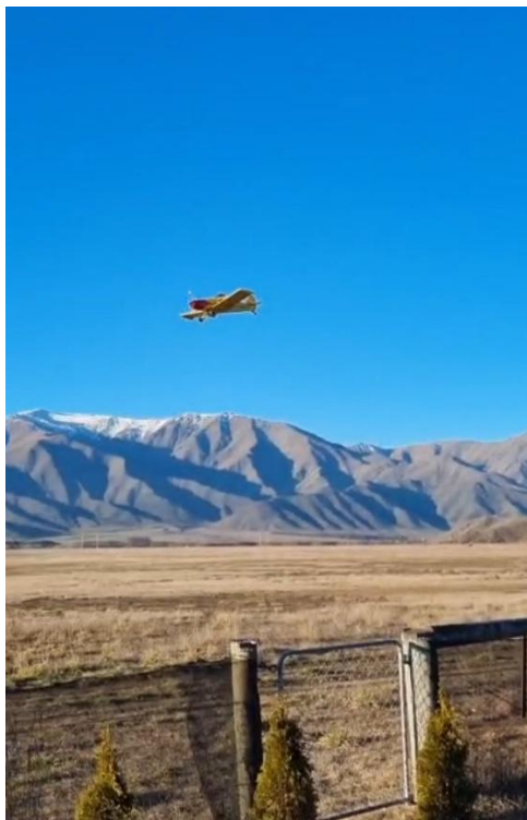
Malcolm caught CNC arriving in Omarama today. Our back up tow plane is here!