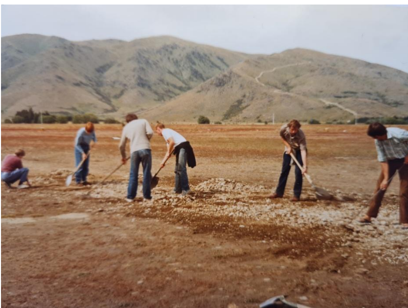
Shifting rocks in the hot sun ~ a favourite gliding past time in Omarama years ago!