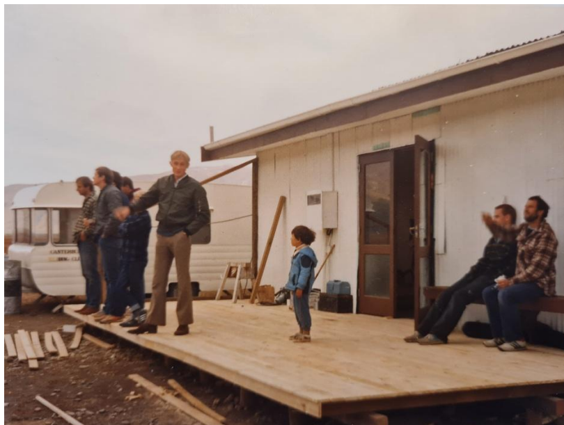
The new deck at Killermont.